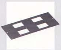
Item ID : D3004 Pierced Plate for 4 x RJ45 / LJ6C Modular 编号 : D3004 四位式数据片适合 RJ45和LJ6C模块

The supply of plates, other than those shown may be available upon request. Plates are interchangeable within the box. Non-standard, clean earth or coloured sockets are available to order. 其它没有列出的配件或者是内地用的10A电源插座，可以按客户的需求而定制。