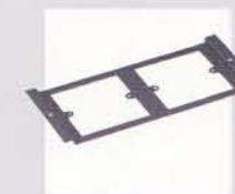
Item ID : HK3347J Standard Data and Telephone Plate 编号 : HK3347J 标准式双位片适合电话 和数据使用 (也可以适合电源插座使用)