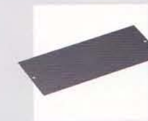
Item ID: HK3000 Blank Plate 编号 : HK3000 空白片